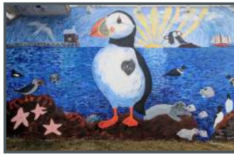
Puffin Mural, Downtown Rockland, ME

9 Water St P.O. Box 1231 Rockland, ME 40841