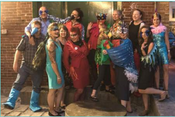
Fabulous feathered party goes at the Flock Party!

local artists of all ages were shown in our gallery and accompanied by a lively opening reception. By combining efforts with other local conservation organizations we have been able to bring our mission to a much larger audience. We hosted two events in partnership with the Georges River Land Trust: a viewing of the film Green Fire , which celebrates the life and work of conservationist Aldo Leopold, and an Earth Day beach clean up followed by a lecture on micro plastics by renowned expert Abigail Barrows. In the summer, we partnered with Avian Haven to produce the First Annual Flock Party , a bird themed costume