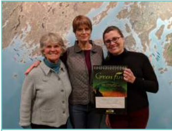
GRLT and FOMCI celebrate Aldo Leopold

In 2018 we brought a variety of excellent programming and activities to our local community in Rockland Maine, and we have had quite a successful year! Highlights include Owls of Maine presented by Chewonki's Traveling Natural History Program. Adults and children alike got to meet some of the magnificent nocturnal raptors of Maine, with a live demonstration and an educational talk about owls. We also hosted our second annual Juried Art Show in which 28 pieces by