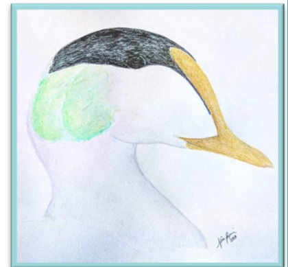
"Male Eider" Sketch by Nora Papain

vocates, and it is rewarding to be able to work alongside so many passionate and focused people. From the refuge staff, who do everything in their power to assist us, to the volunteers who sent treats and support, it was an incredible experience to work for and with the refuge. It's comforting and motivating to be surrounded by others who are as passionate as you and work just as hard or harder to conserve the species you love. So while nothing can quite compare to black guillemot chicks screaming at you, or watching tern chicks practice flight, the best part of the summer was doing all of that with the support of the refuge and the Friends group.