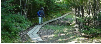
Photo of Birch Point Trail on Petit Manan

The Maine Coastal Islands National Wildlife Refuge is known for its islands that protect nesting seabirds in the Gulf of Maine. But did you know that the Refuge offers places you can visit for outdoor fun on the mainland? June is Great Outdoors Month, and a good time to put on your hiking boots and explore one of refuge's trails . It's a great way to experience Maine's own Great Outdoors—without the crowds.